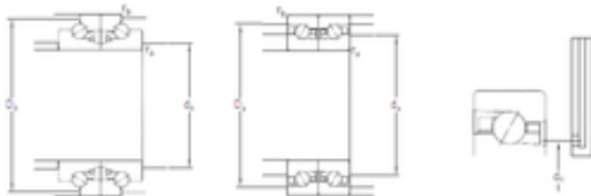
BTM 70 BTN9/HCP4CDB Bearing 2D drawings and 3D CAD models

70 mm x 110 mm x 18 mm SKF BTM 70 BTN9/HCP4CDB angular contact ball bearings